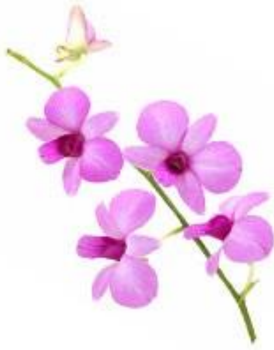
Queensland Floral Emblem